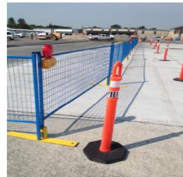
Construction Zone Fencing

Safety barricades will be placed on apron 1 during the civil work required for removing asphalt and replacing the sub-base as well as re-paving of the surface. The active work areas will be fenced off using medium height fencing and appropriate marking. Alpha Aviation works directly with the fence rental company to ensure appropriate access and operational control during periods of construction.